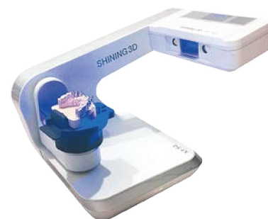
Black & White Texture